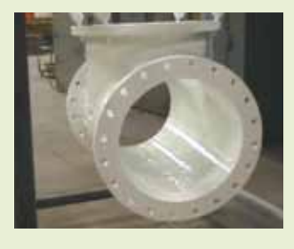
▲ PPA 571 coatings on slurry▼ and sewage pumps and fittings.

Plascoat® PPA 571 has a wide range of potable water approvals such as NSF/ANSI 61 and conforms to the requirements for FDA food contact.