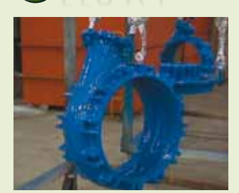
▼ Plascoat® PPA 571 lined pipes for desalination plants.