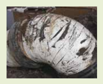
▲ Ductile iron pipe with deteriorated PVC tape wrap after 5 years.

These results have indicated a buried pipe lifetime of over 200 years.