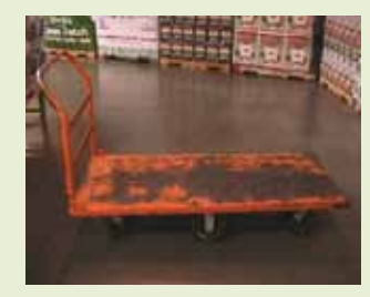
▲ Storage cart coated in liquid paint after 18 months' use.

▼ Plascoat® PPA 571 coated cart after 18 months' use.