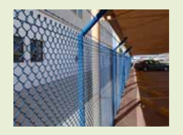
▲ Successful 15-year field test in Dubai.

The abrasion rate of Plascoat® PPA 571 is half that of standard coatings and the fading rate is 1/20th.