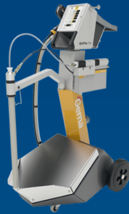
OptiFlex® Pro B Spray