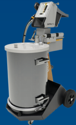
OptiFlex® Pro F Spray