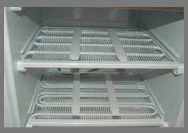
Plascoat Talisman 30 is ideal for coating freezer evaporator trays as it provides a smooth, low friction and hard wearing finish.