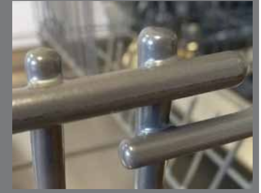
Plascoat Talisman 10 provides comprehensive coverage for complex edges and wirework