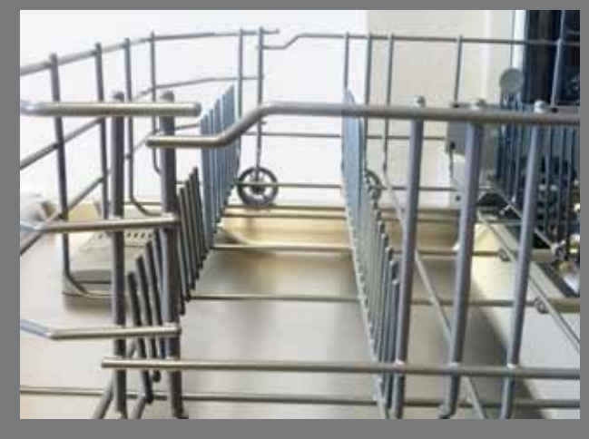
Millions of dishwasher baskets like this one are coated in Plascoat Talisman 10.

One in six dishwasher baskets manufactured globally today are coated in Plascoat Talisman 10