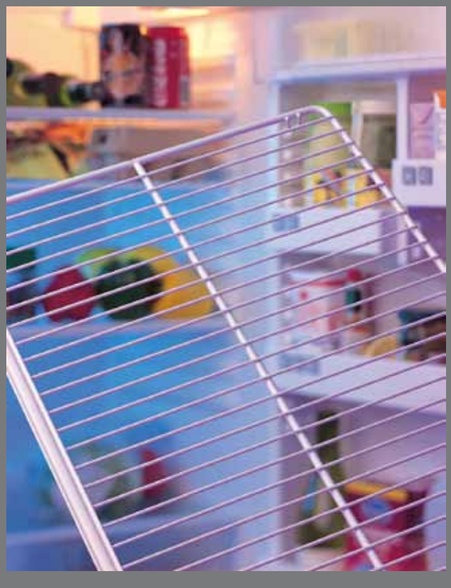
Plascoat NG30 is a popular coating for refrigerator shelves because of its hard glossy, easy to clean finish and the amount of money that appliance manufacturers save by using it.