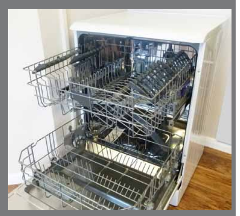
This dishwasher manufacturer almost doubled its product profit margin by switching to Plascoat Talisman 10 to coat its dishwasher baskets.

Plascoat has two separate manufacturing sites located in Europe. This ensures that supply has a low risk of disruption.