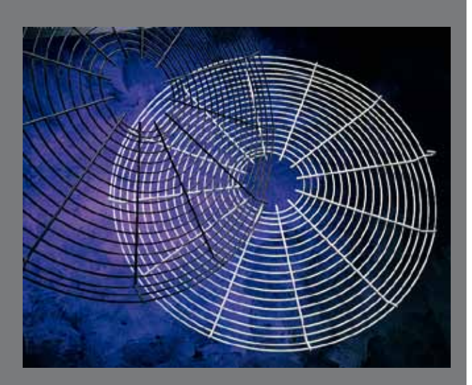
Plascoat WireGuard F40 is ideal for coating external fan quards due to its ability to withstand prolonged UV exposure and wide temperature fluctuations.