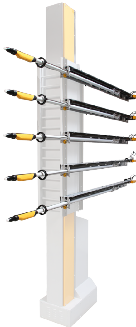
ZA13 with five gun axes UA04