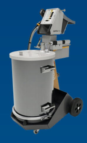
OptiFlex® Pro F Spray