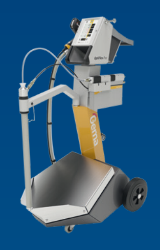
OptiFlex® Pro B Spray