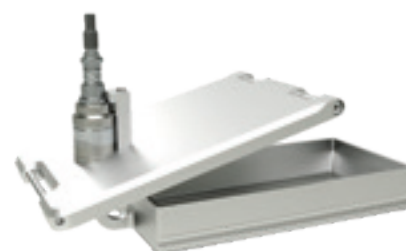
Ultrasonic sieve insert US07