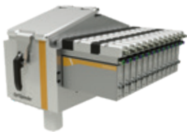
OptiSpeeder powder hopper

The switching from fresh powder to recovery operation and cleaning mode is fully automatic.