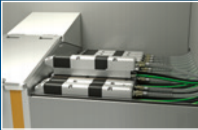
OptiSpeeder with OptiSpray AP01