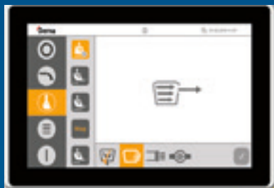
OptiControl powder management control