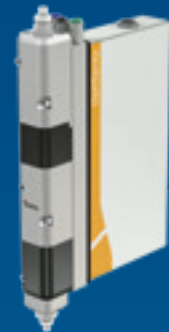
OptiSpray AP01 application pump

The device is equipped with an automated rinsing function for cleaning the pump, the suction tubes and the gun.