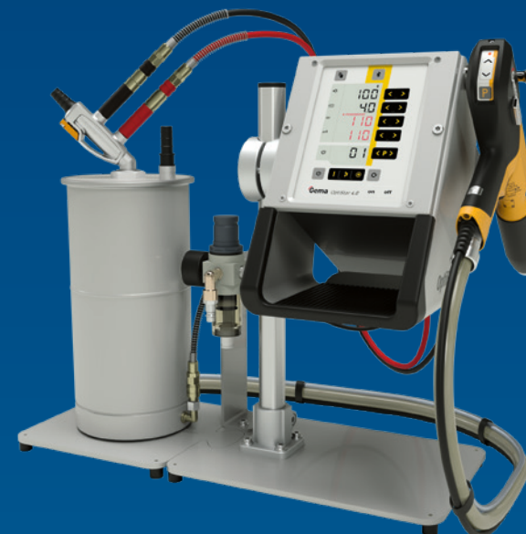
OptiFlex® Pro L