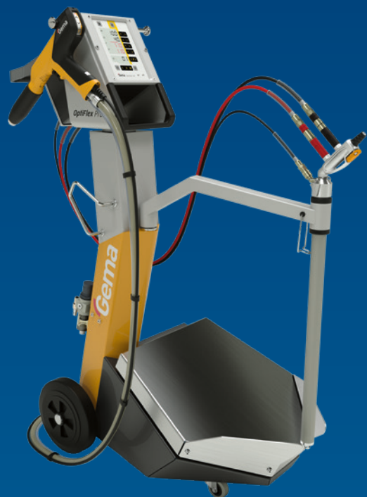
OptiFlex® Pro B