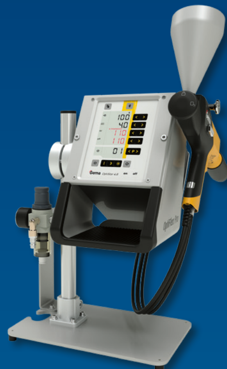
OptiFlex® Pro CF