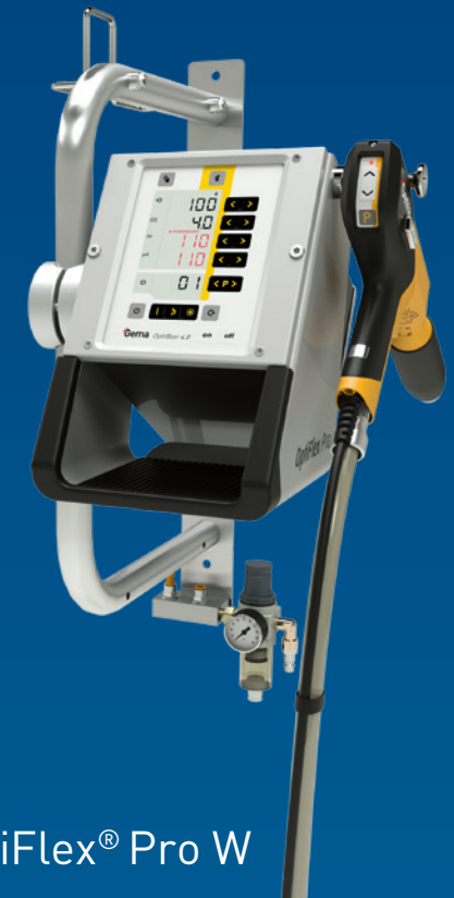
OptiFlex® Pro W