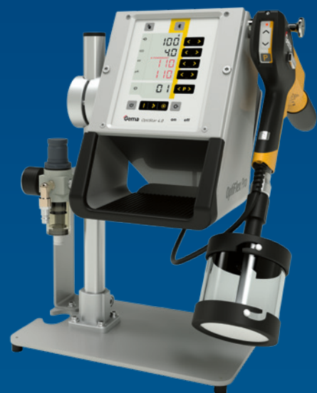
OptiFlex® Pro C