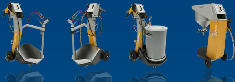
OptiFlex® Pro B OptiFlex® Pro Q OptiFlex® Pro F OptiFlex® Pro S