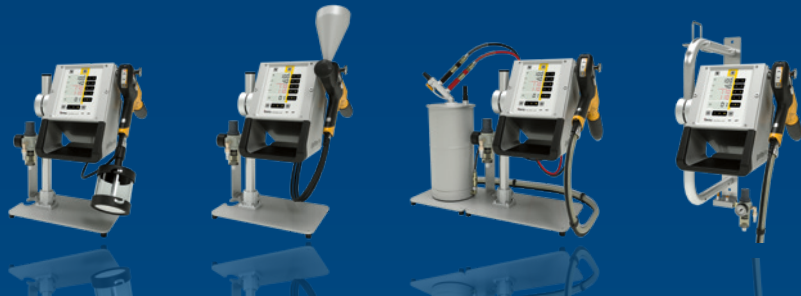
OptiFlex® Pro C OptiFlex® Pro CF OptiFlex® Pro L OptiFlex® Pro W