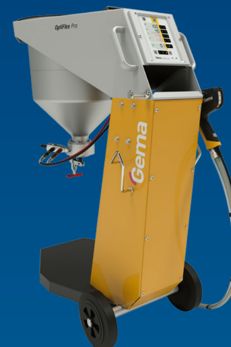
OptiFlex® Pro S