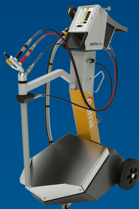
OptiFlex® Pro Q