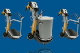
OptiSelect® Pro Type GM04 OptiStar® Type CG21 OptiFlex® Pro Manual coating equipment