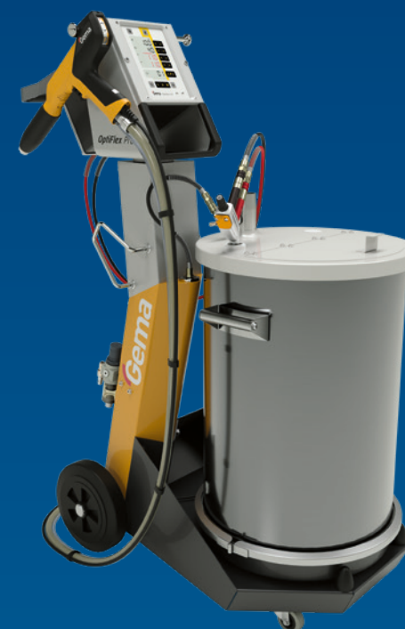
OptiFlex® Pro F