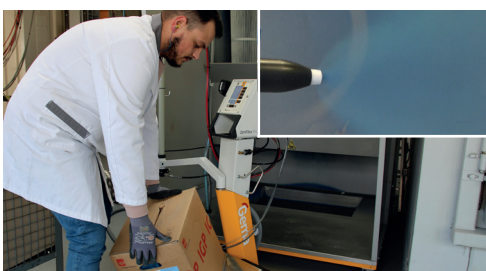
Step 5: Change the powder box during automatic cleaning