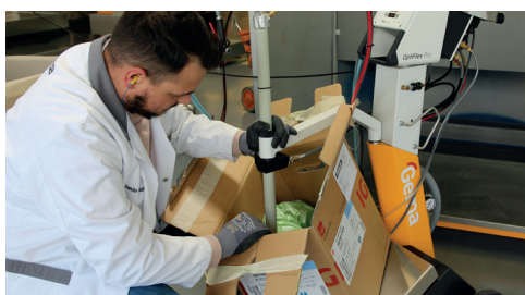
Step 6: Lower the suction tube in the new colour