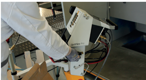
Step 1: Activate the air mover