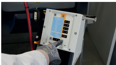
Step 4: Start the cleaning process