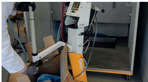
Step 2: Raise the suction tube