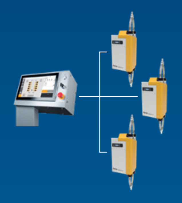
Connectivity of OptiFeed 4.0 allows single point monitoring of all the bulk pumps in your system network.

This makes the OptiFeed 4.0 the ideal powder feed system for Industry 4.0.