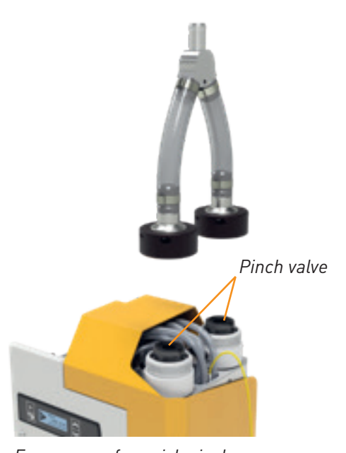
Easy access for quick pinch valves release

When service is required, the quick disconnect access to critical components allows fast removal, inspection or replacement without removing the entire pump.